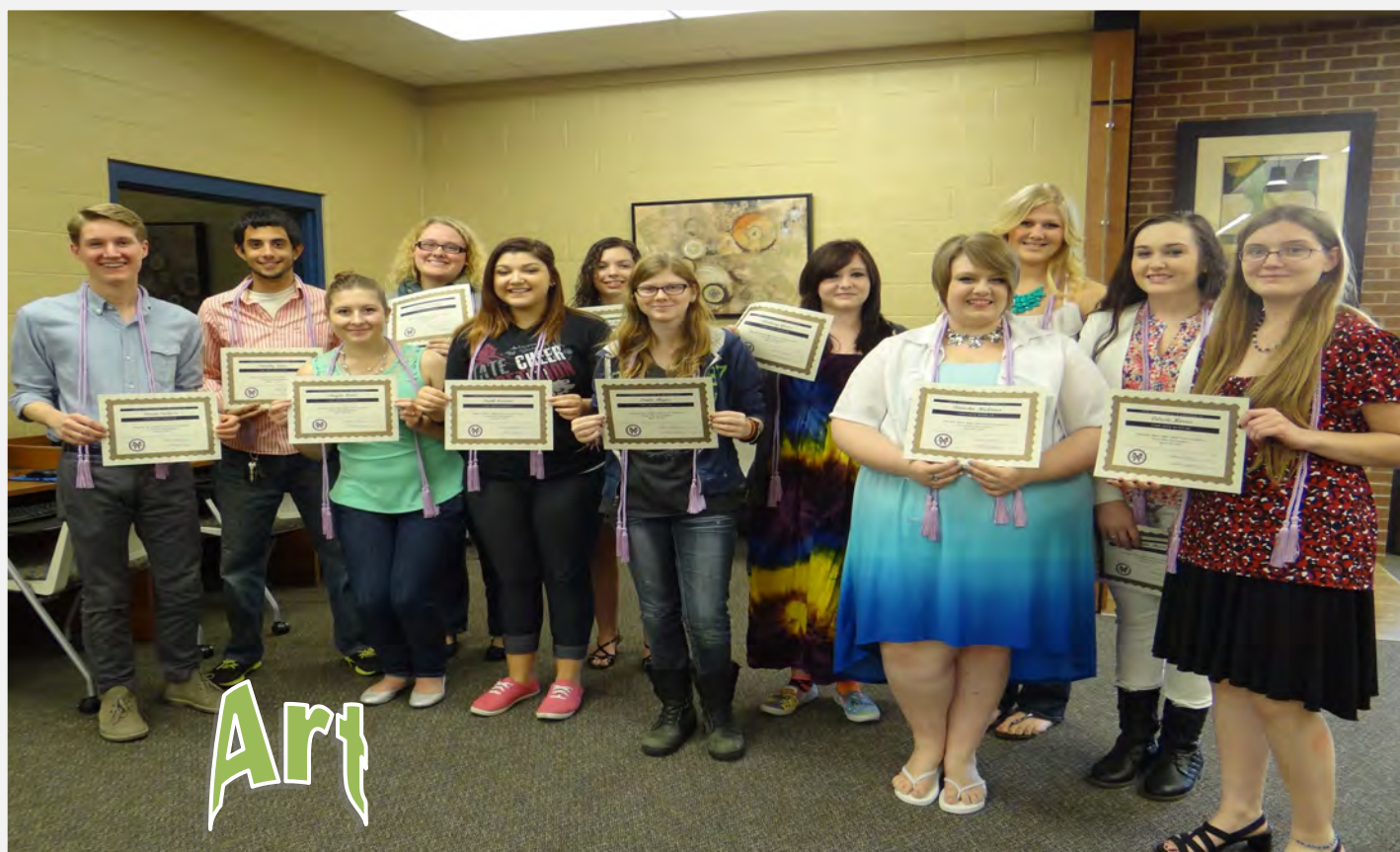
Pictured above are the Seniors who received their Visual Arts Concentration Achiever Awards and cords. Seniors, pictured below, received the Vocal Music Concentration Achiever Awards and their lilac colored chords to be worn at their 2014 graduation!