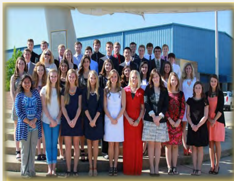
Nominees are pictured to the left.