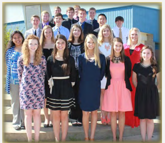
Finalists are pictures to the right.